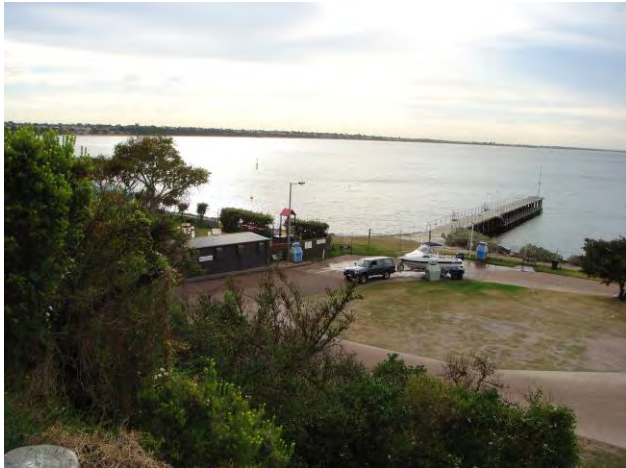
C. Looking south east from cliff top out over the western car park / boat washing area of BMYS towards Mordialloc.