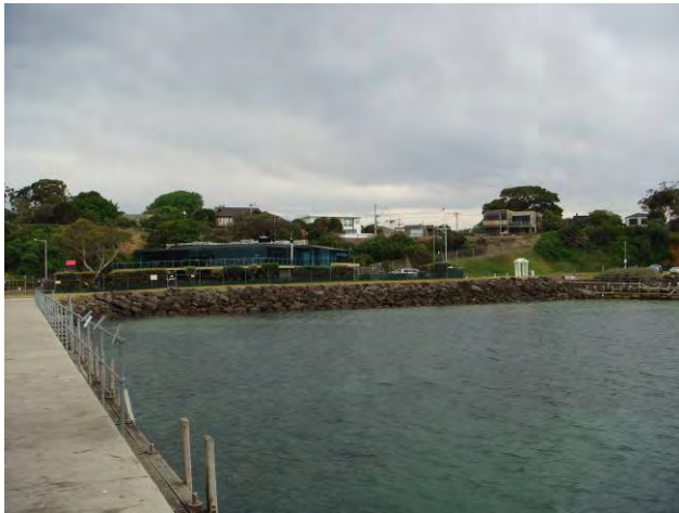
P. View north back towards club house from the existing concrete jetty.