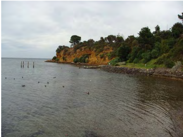
S. Remains of Keefers jetty to the west of BMYS.