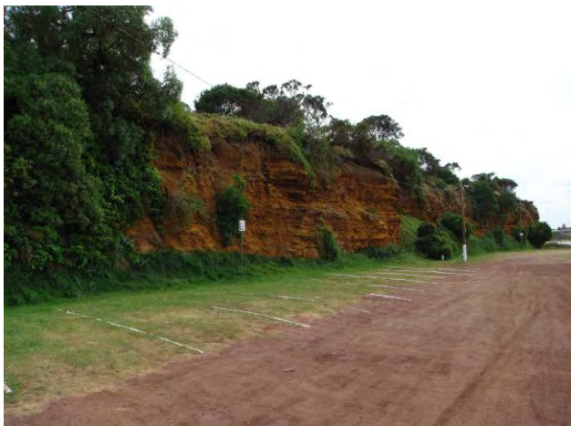
J. Ten metre high cliffs and existing eastern car / trailer parking.