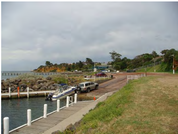
L. Eastern boat ramp, looking west.