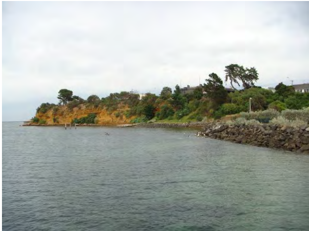
O. View northwest from the existing concrete jetty, note Beaumaris Hotel behind trees in background.