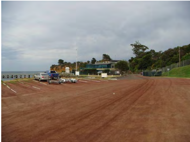
K. Eastern car / trailer park looking west towards club house.