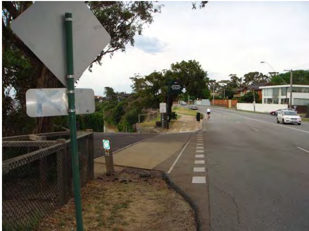
G. Access road to BMYS onto Beach Road and closing bike path. (looking north west)