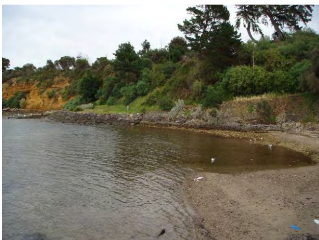
R. West from BMYS boundary over Keepers beach to the old Keepers Boat hire site. Note. Location of the closed public path to foreshore.