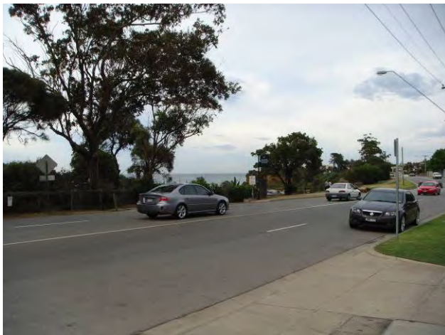
H. Access road to BMYS onto Beach Road and closing bike path. (looking west).

Note, that all views of existing facilities are obstructed by cliff and vegetation.