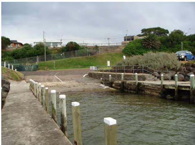
N. Central launching ramp only usable in still conditions, and access road in background.