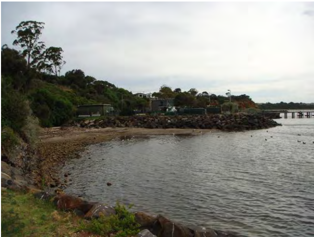
T. Looking east back towards BMYS from the remains of Keefers boat Shed.