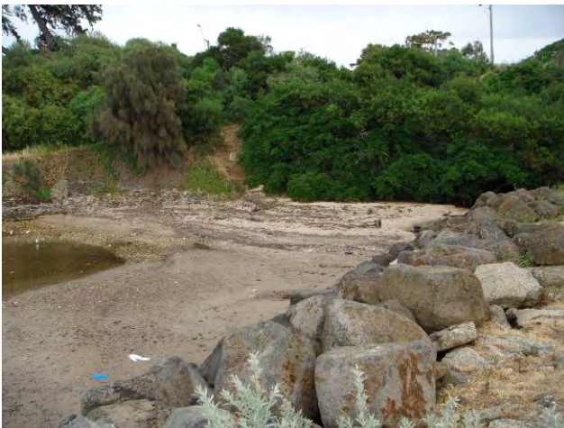
Q. Western boundary of BMYS at the exit of the existing Storm Water drain "Keepers beach".