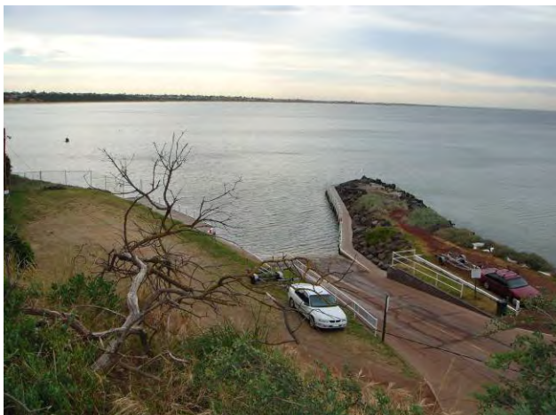
F. Looking south east from cliff top over the eastern boat ramp and groyne constructed early 1990's.