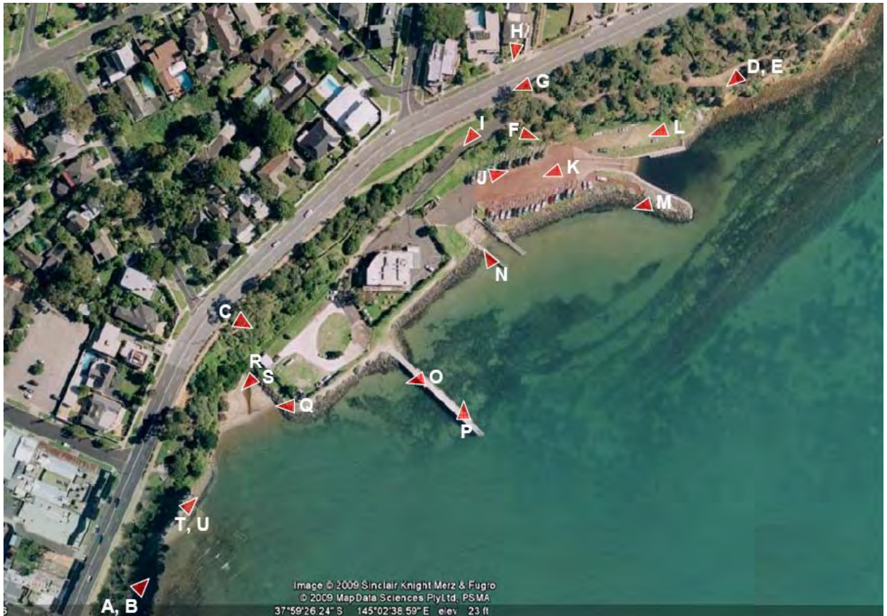
BMYS aerial site photo – index of photo locations