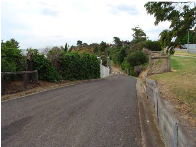
I. View down steep access road.

Note, that all views of existing facilities are obstructed by cliff and vegetation.