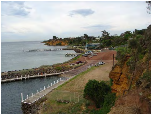
D. Looking west from cliff top from furthest eastern point of the site.