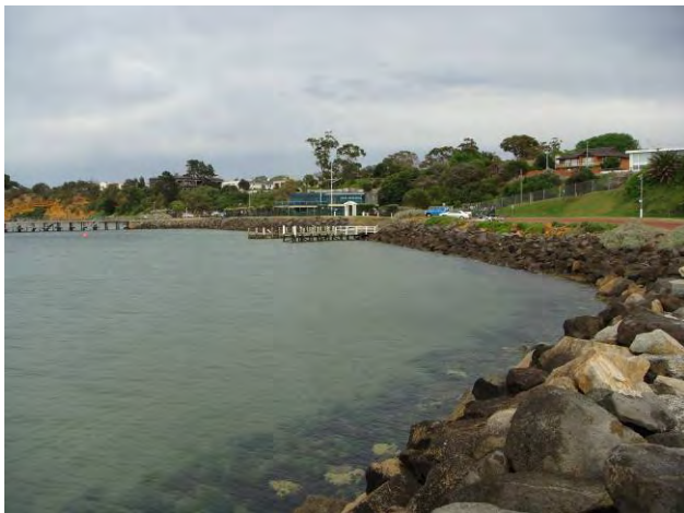
M. Existing rock retaining wall, and area of seabed that requires regular maintenance dredging.