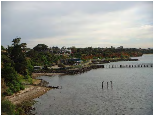
A. Looking east towards BMYS from Keys street car park lookout.