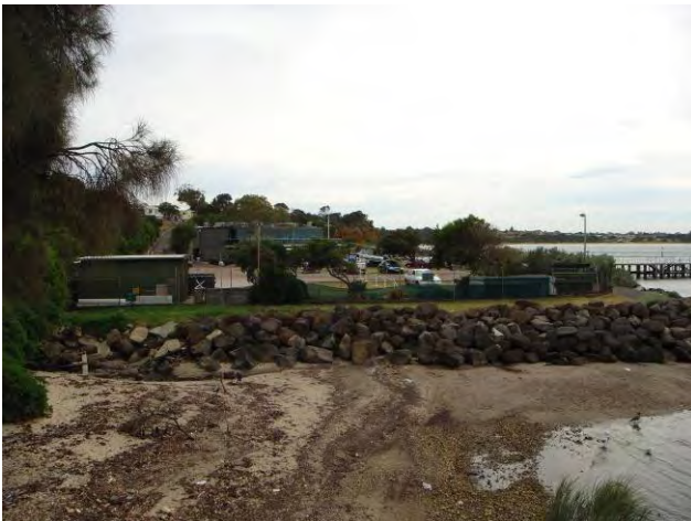
U. View looking east across Keefers Beach to BMYS.