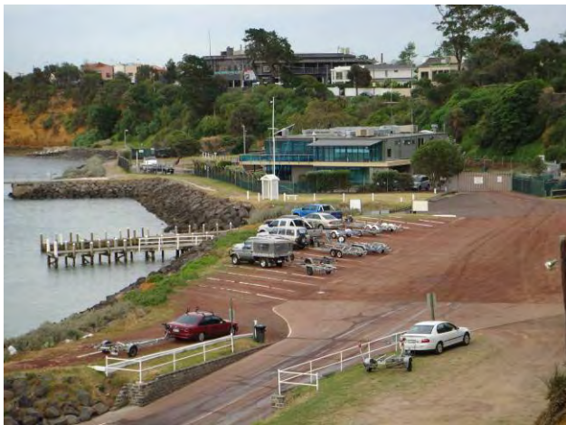
E. Looking north west from cliff top.