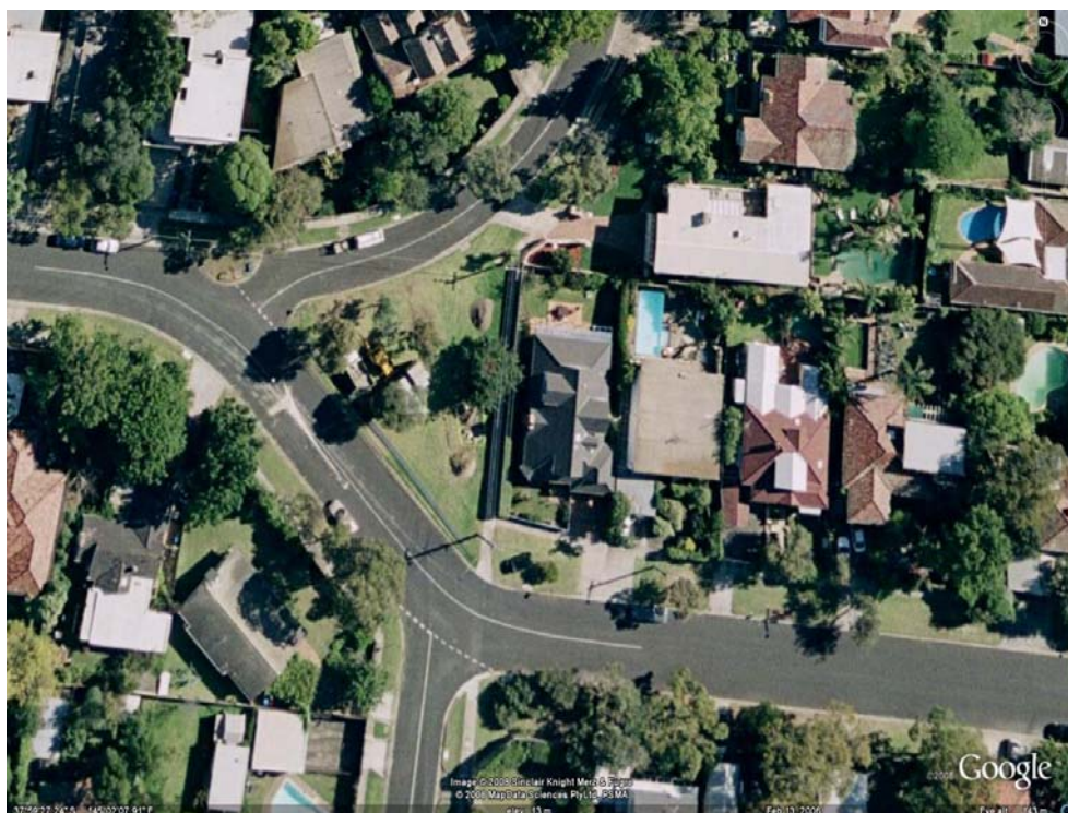
The High Street Triangle and Holding Street Tree Space seen by Google Earth in 2008