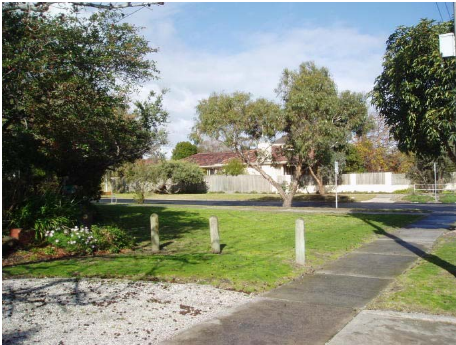
Tramline Corner, at junction of Holding Street and Reserve Road

The three small areas above could, if managed with a common theme consistent with Beaumaris's distinctive coastal bushland heritage, provide a vital linkage between remnant Beaumaris character in the F L Yott Reserve and the Anglican Church land to the east and the stronger remnant character to the west of Reserve Road. Such a management commitment should be made clear by Council bestowing a name on each site, or on the three sites as a linked group adorning Holding Street.