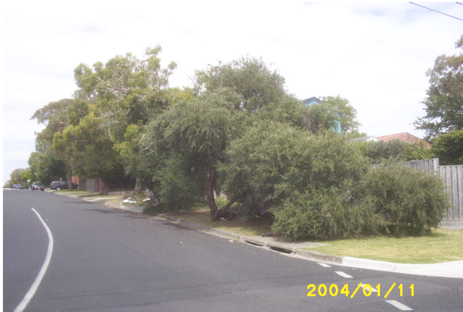
The Holding Street Tree Space, saved from being sold in 2004

Those linkage areas include several opportunities to proclaim and perpetuate a little of the formerly renowned ambience of Beaumaris using existing Council land, which is an especially practical option, because no expensive or disruptive land purchase would be involved. There are three separate, distinctive pieces of Council land in the short length of Holding Street, Beaumaris, identified in that letter as the Holding Street Tree Space, the High Street Triangle and Tramline Corner .