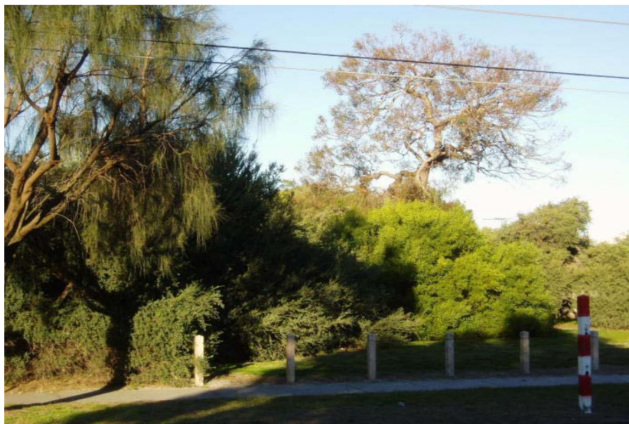
The Concourse Bushland in 2006

The Concourse Bushland: It is pleasing to see on Pages 33 and 34 that the Concourse Bushland is shown in dark green on Maps 7 and 8. BCS Inc. has previously written to Council asking for this Council-owned land to have its zoning changed from its present Business 1 Zoning to a Public Park and Recreation Zoning.